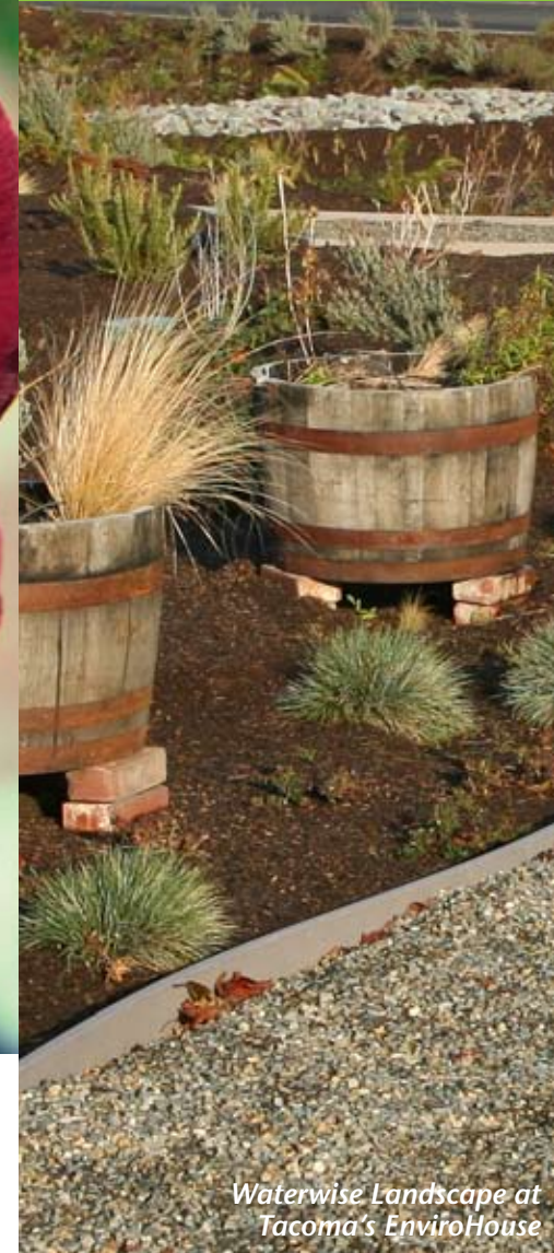
Waterwise Landscape at Tacoma's EnviroHouse

Landscaping significantly impacts the natural resources a building uses. Making sustainable choices about the way a landscape is planned, planted, and maintained can: